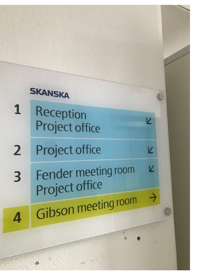
Figure 2 Floor Description

There is an existing lift serving all floors. Condition and service history TBC.