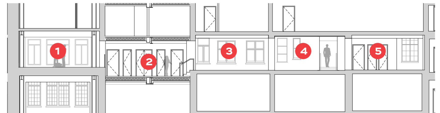
Level 2 - Office floors along 21 - 25 Denmark Street