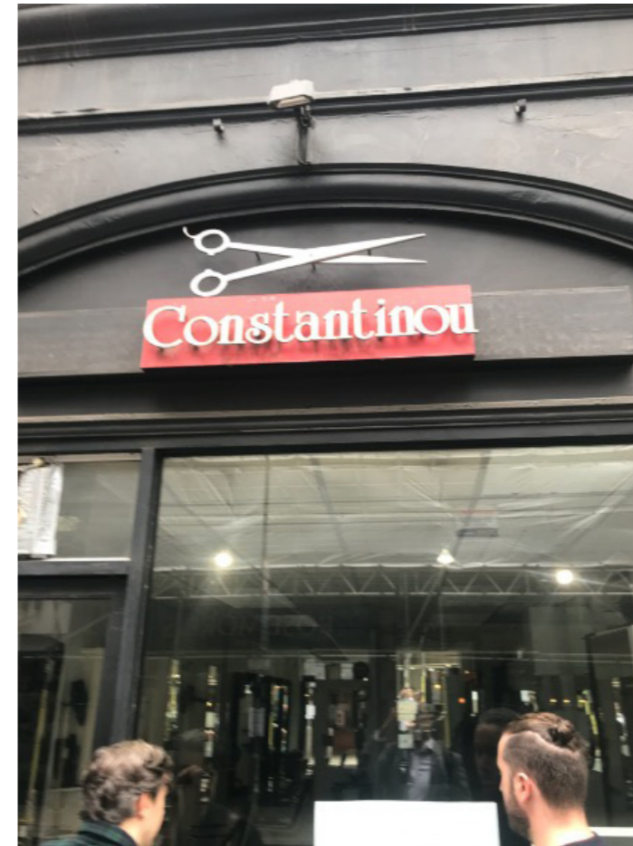
Figure 1 Front Elevation